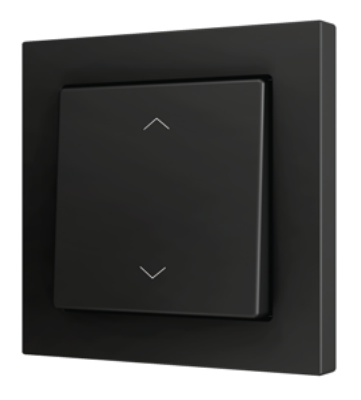
Soft Single Up and down switch