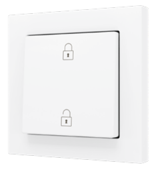
Soft Single Up and down switch