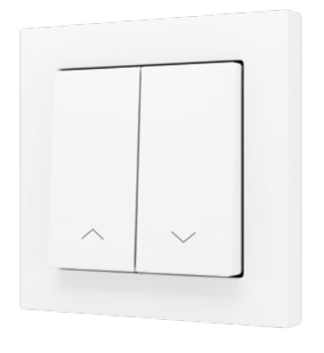
Soft Double Down switch