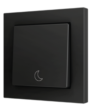
Soft Single Down switch