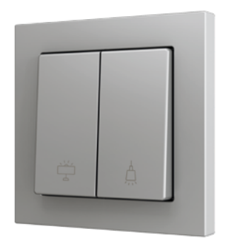
Soft Double Down switch