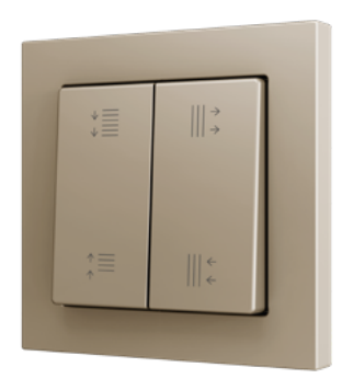
Soft Double Up and down switch