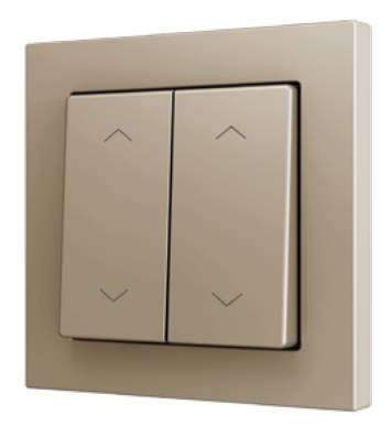
Soft Double Up and down switch