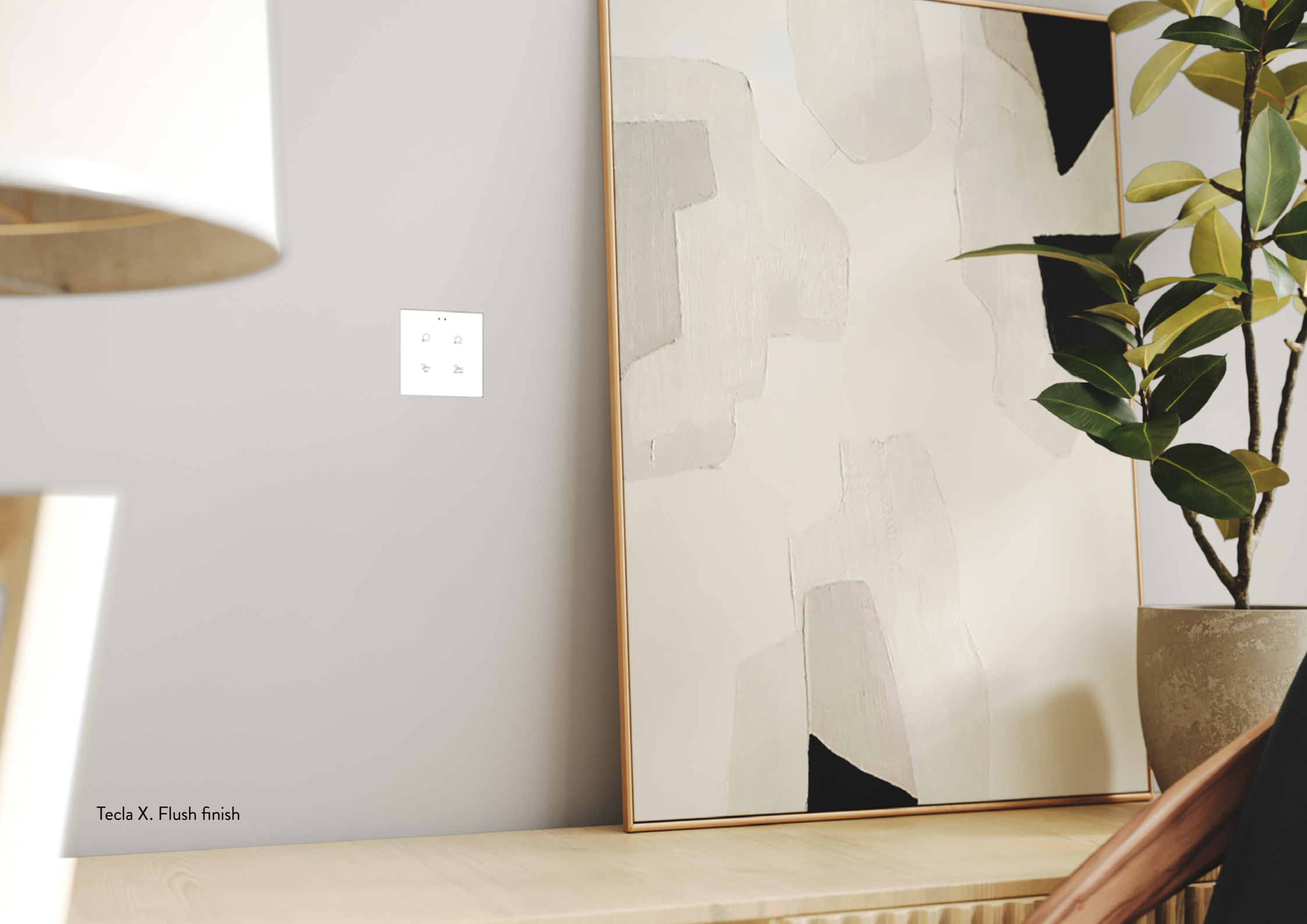
Tecla X. Flush finish