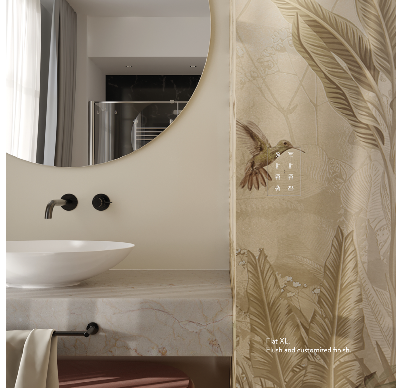
Flat XL. Flush and customized finish.

Elevate your space with the flush finish on both our capacitive touchscreens and our Flat capacitive touch switches.